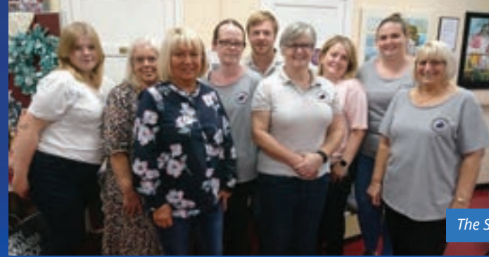
The Stroud Stragglers

A big thank you to Stroud Stragglers (community fundraising group) for their incredible support. The group threw themselves into the Coffees that Count campaign, raising over £700 at a coffee morning at Rodborough Community Hall, £576 from a Craft Fair in Stonehouse and almost every week during the autumn sold Cobalt cards and calendars anywhere they could, including markets and local stores. The total raised was a fantastic £2,710.