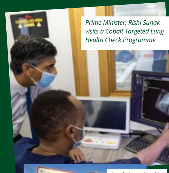
Prime Minister, Rishi Sunak visits a Cobalt Targeted Lung Health Check Programme

national cancer screening programme. This is a first step to enabling the screening programme to be rolled out across the UK. When up and running, everyone aged between 55 and 74 who smokes or who has smoked, will get an invitation to attend an assessment and if clinically indicated, a low dose CT scan of the lungs. The national screening programme is likely to take some time to roll out. In the meantime, however, the TLHC service will continue to provide this important service.