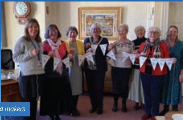
Winchcombe card makers