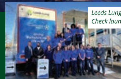
Leeds Lung Health Check launch

Cobalt is now supporting two new TLHC programmes with low dose CT scanning. The Liverpool programme is provided in partnership with the Liverpool Heart and Chest Hospital. The Leeds programme was launched in January 2023 in partnership with Leeds Teaching Hospitals NHS Trust, and is funded by Yorkshire Cancer Research.